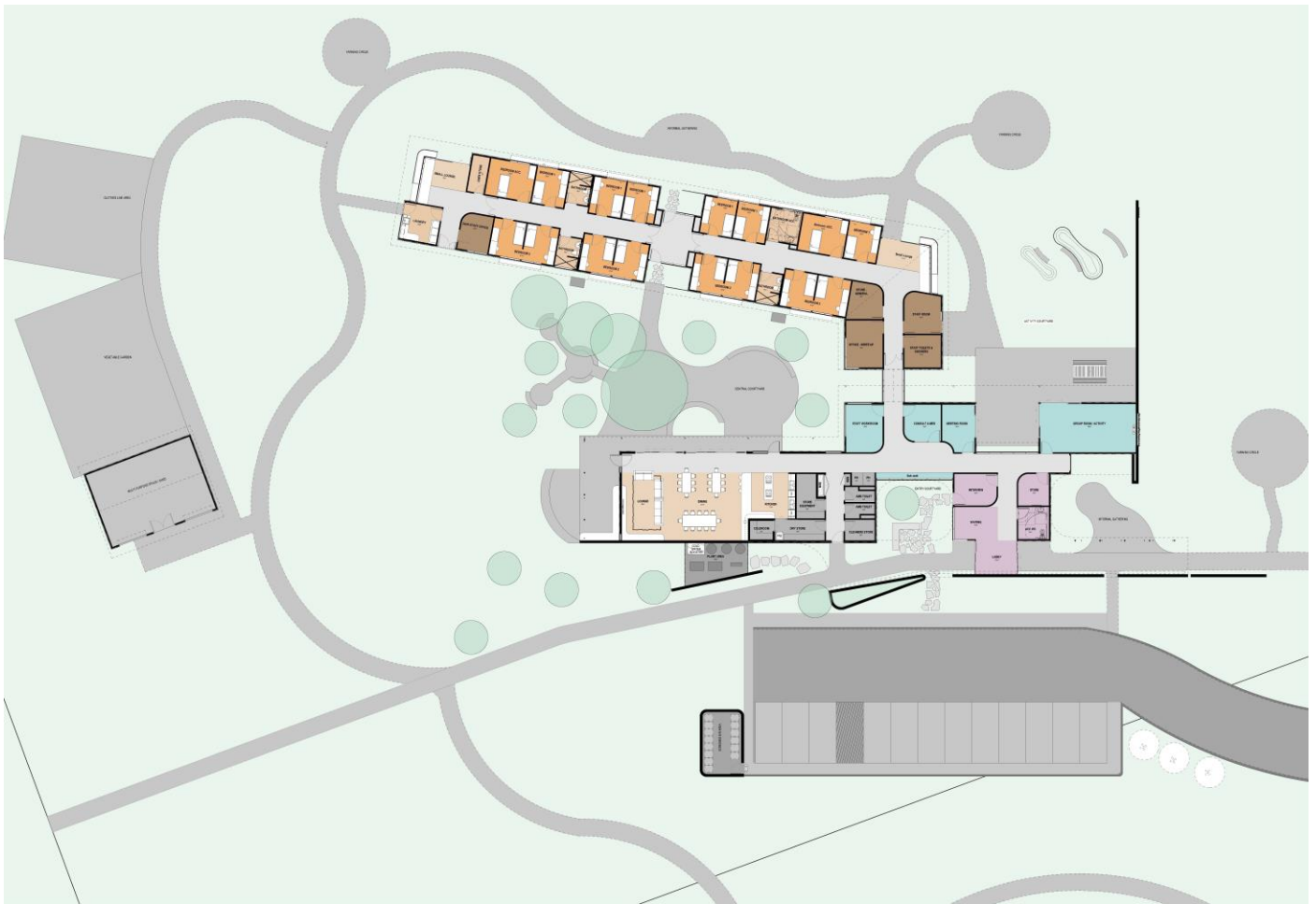
FIGURE 6: STAGE 1 FLOOR PLAN

As part of the usual process of assessment, the DA package and all supporting documentation will be available on the Dubbo Regional Council's website when it goes on public exhibition.