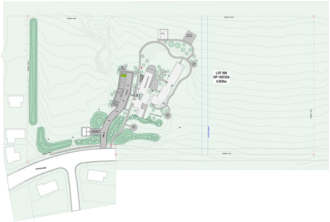
FIGURE 7: STAGE 1 SITE PLAN