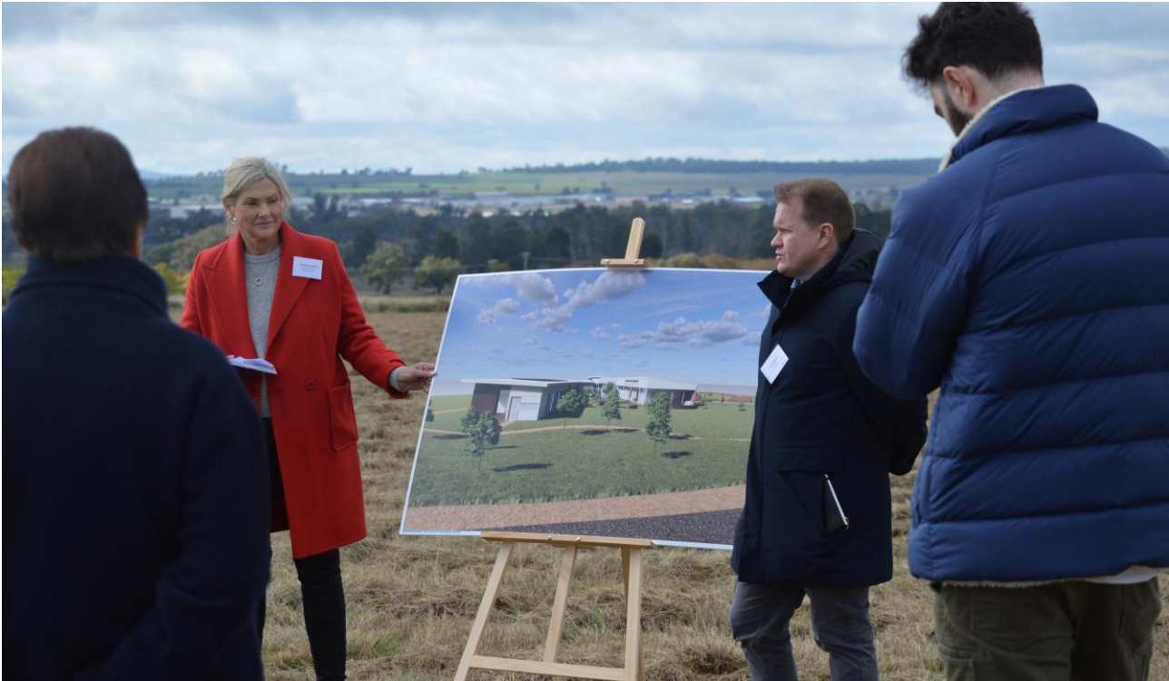
FIGURE 1: PHOTOGRAPH FROM THE GUIDED COMMUNITY WALKS