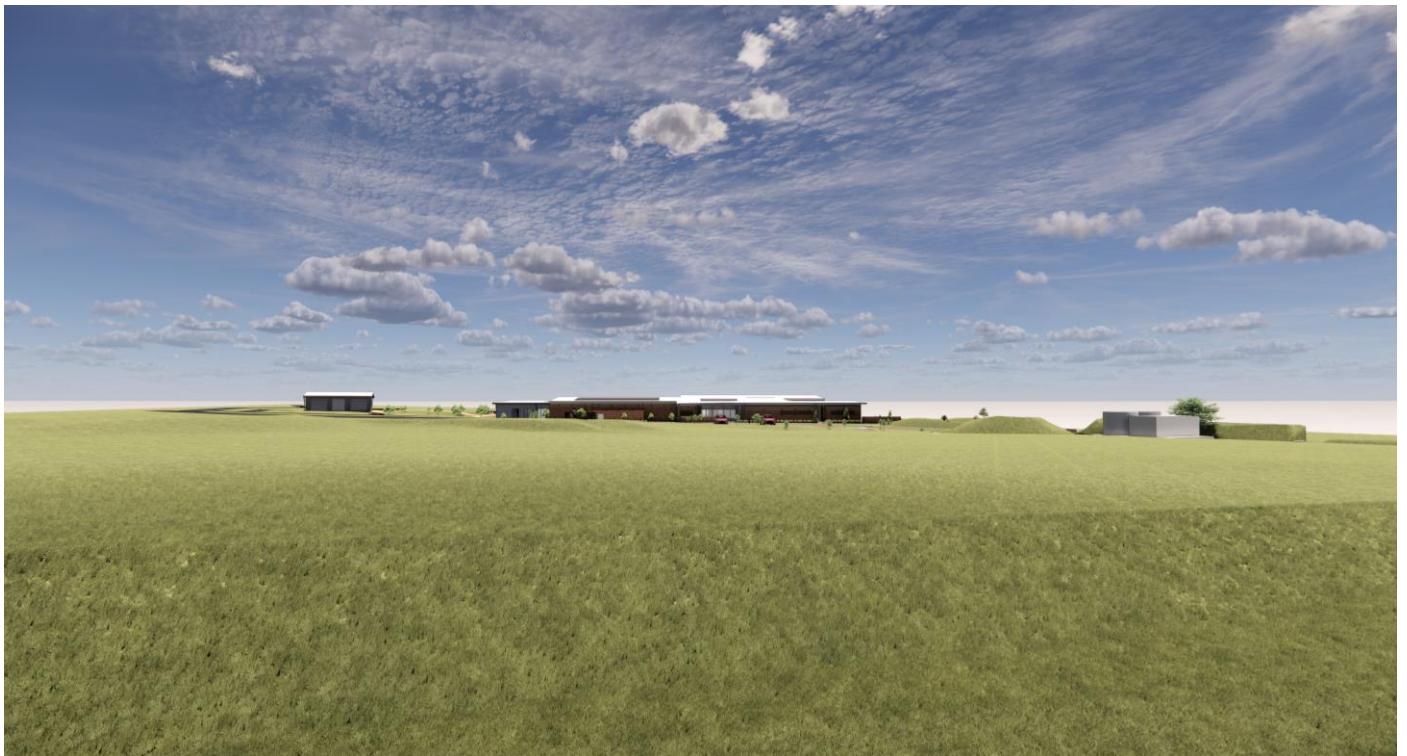
FIGURE 5: ARTISTS IMPRESSION OF THE SOUTHERN RECREATION AREA VIEWED FROM YARRA PLACE