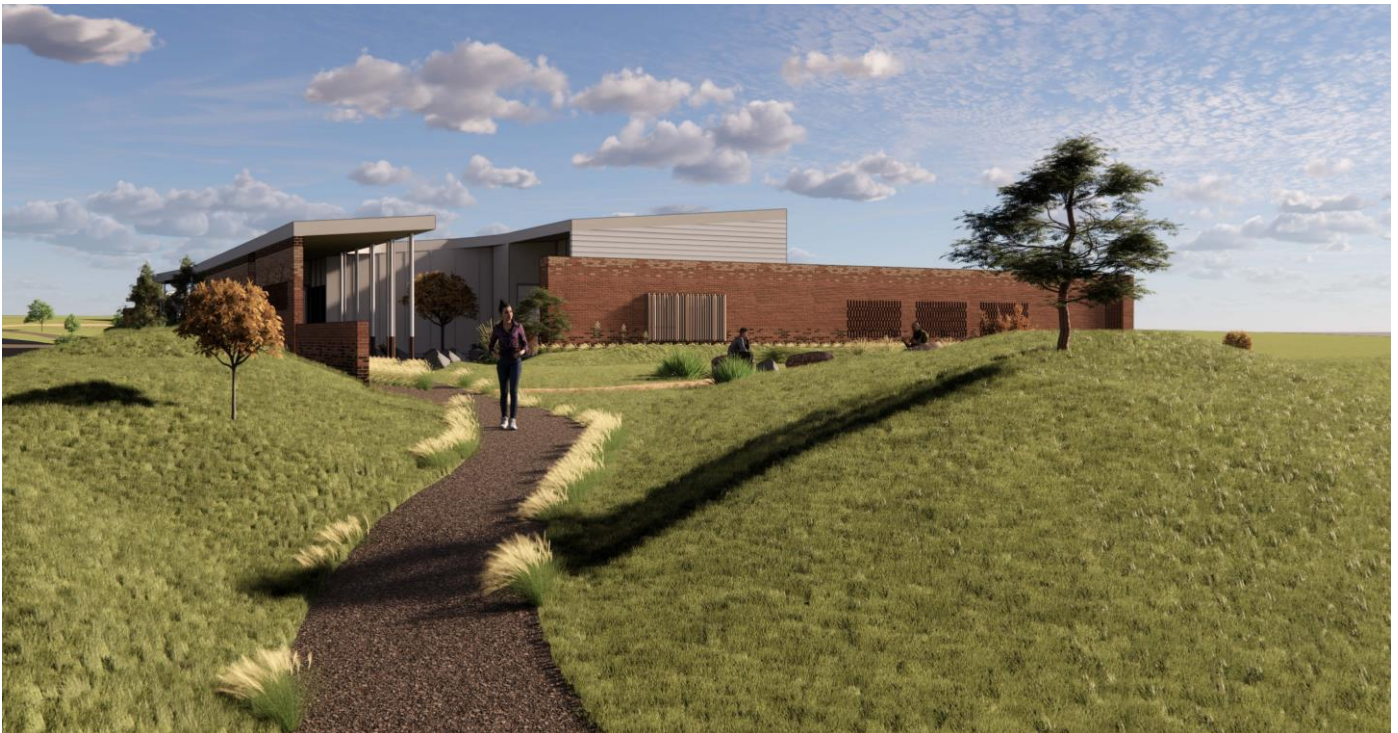
FIGURE 3: ARTISTS IMPRESSION OF THE CENTRE FROM SPEARS DRIVE

A fly-through of the proposed building can be viewed on the UrbanTalk Project Listing at www.urbantalk.com.au/projects/dubbo-aod