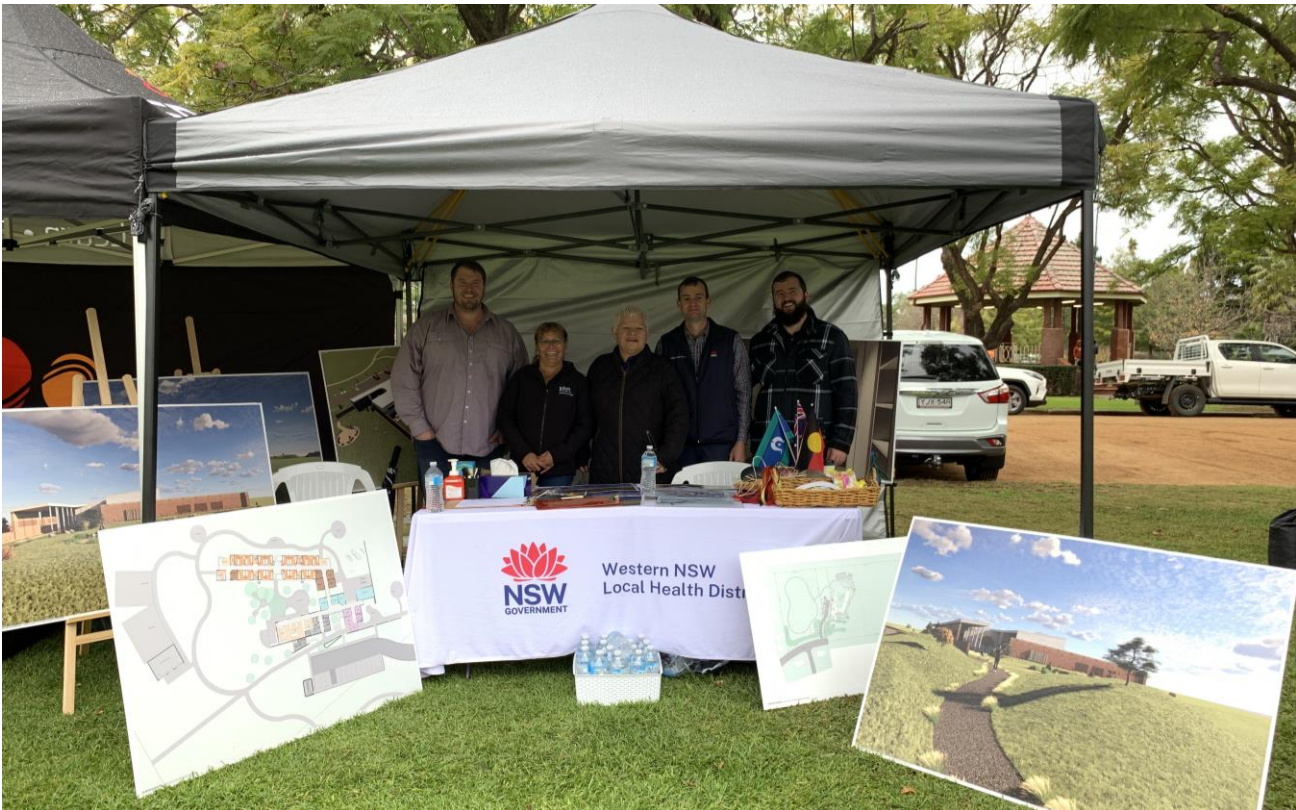
FIGURE 2: PHOTOGRAPH FROM THE POP UP NAIDOC DAY EVENT