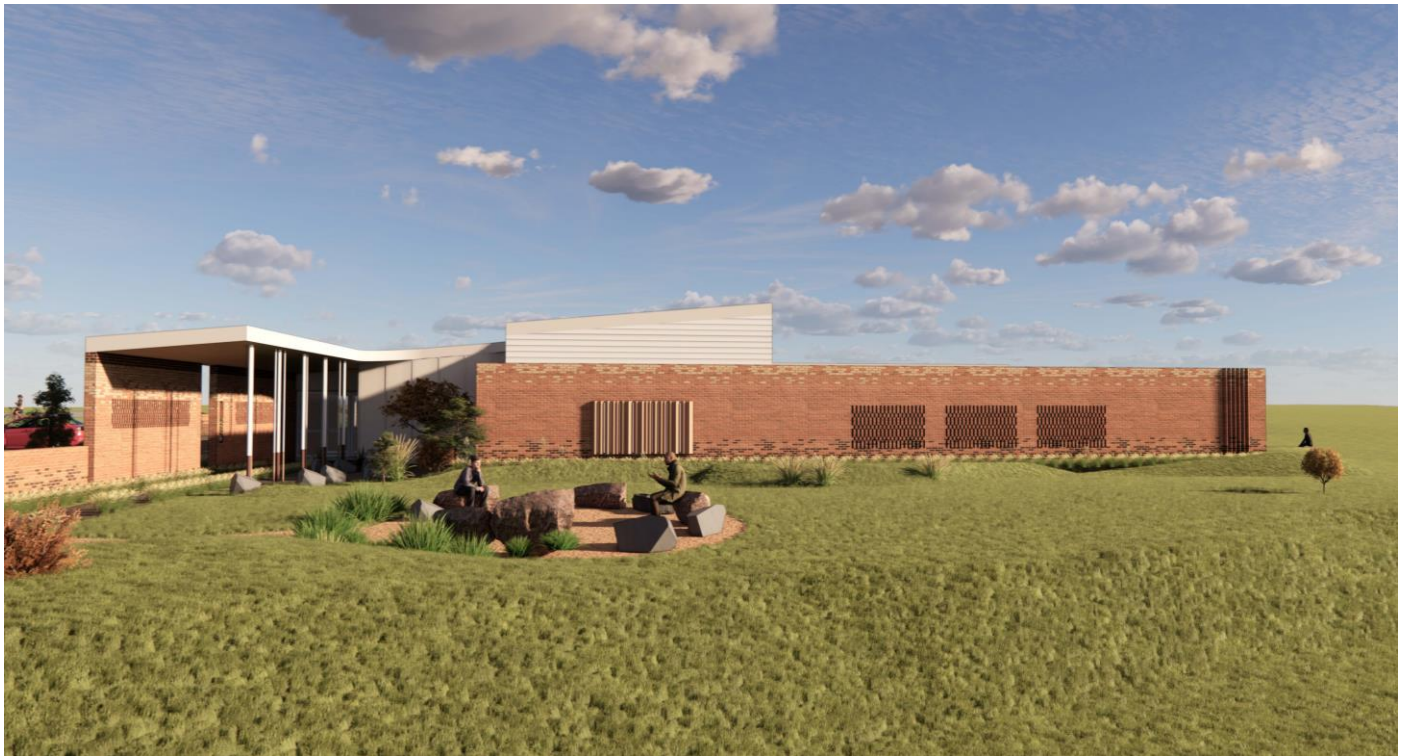
FIGURE 4: ARTISTS IMPRESSION OF YARNING CIRCLES